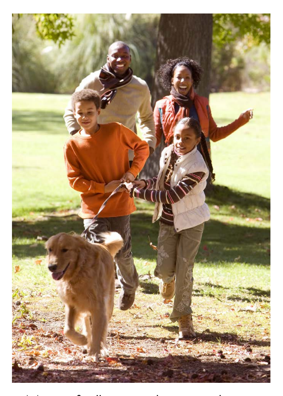
Most of all, your dog needs a family and lots of love!