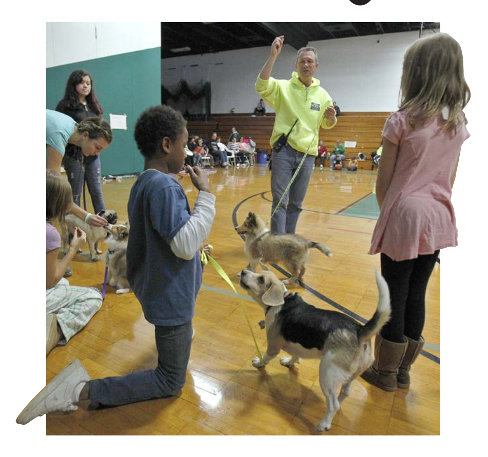
Written by Blane Jeffries