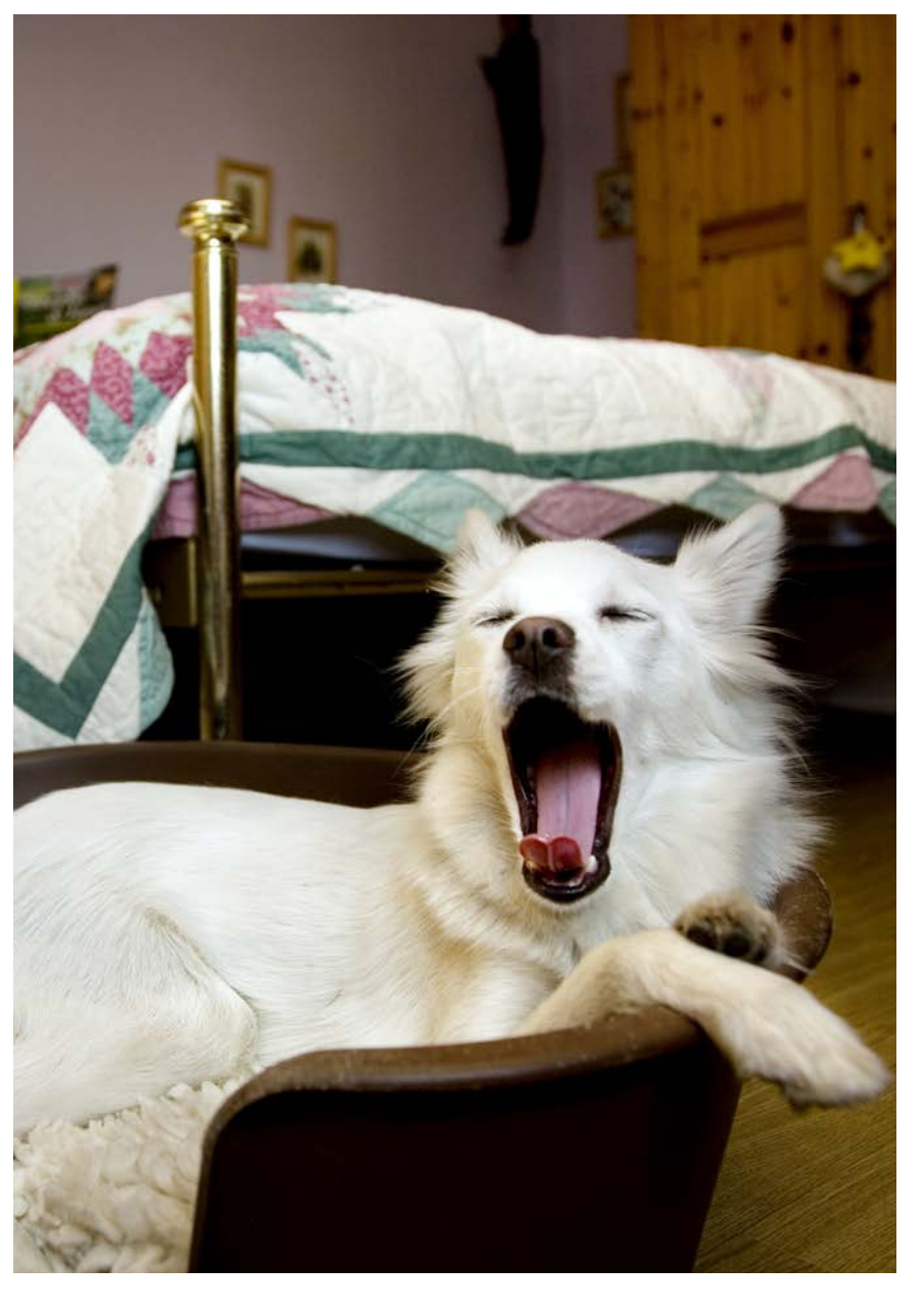
Your dog needs a warm place to sleep.