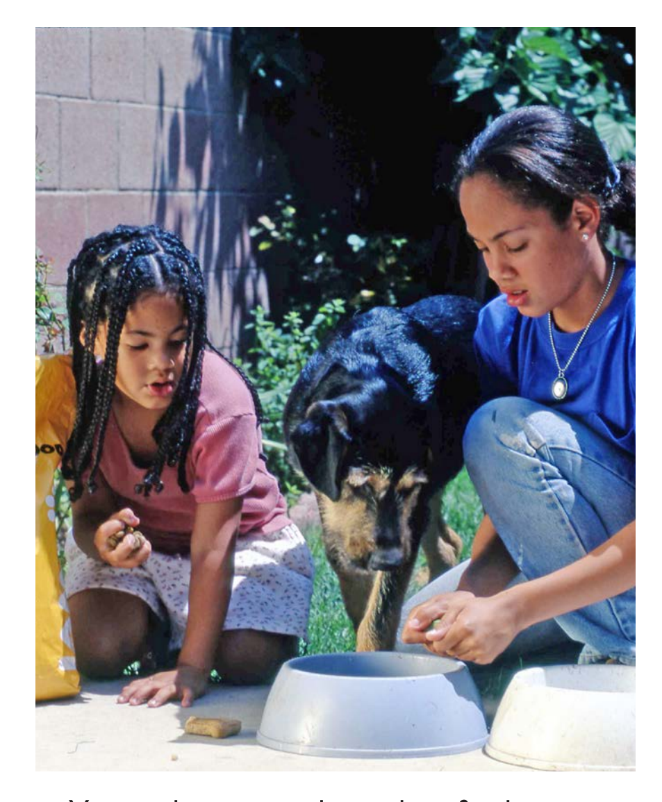
Your dog needs to be fed twice a day. Your dog needs water all day long.