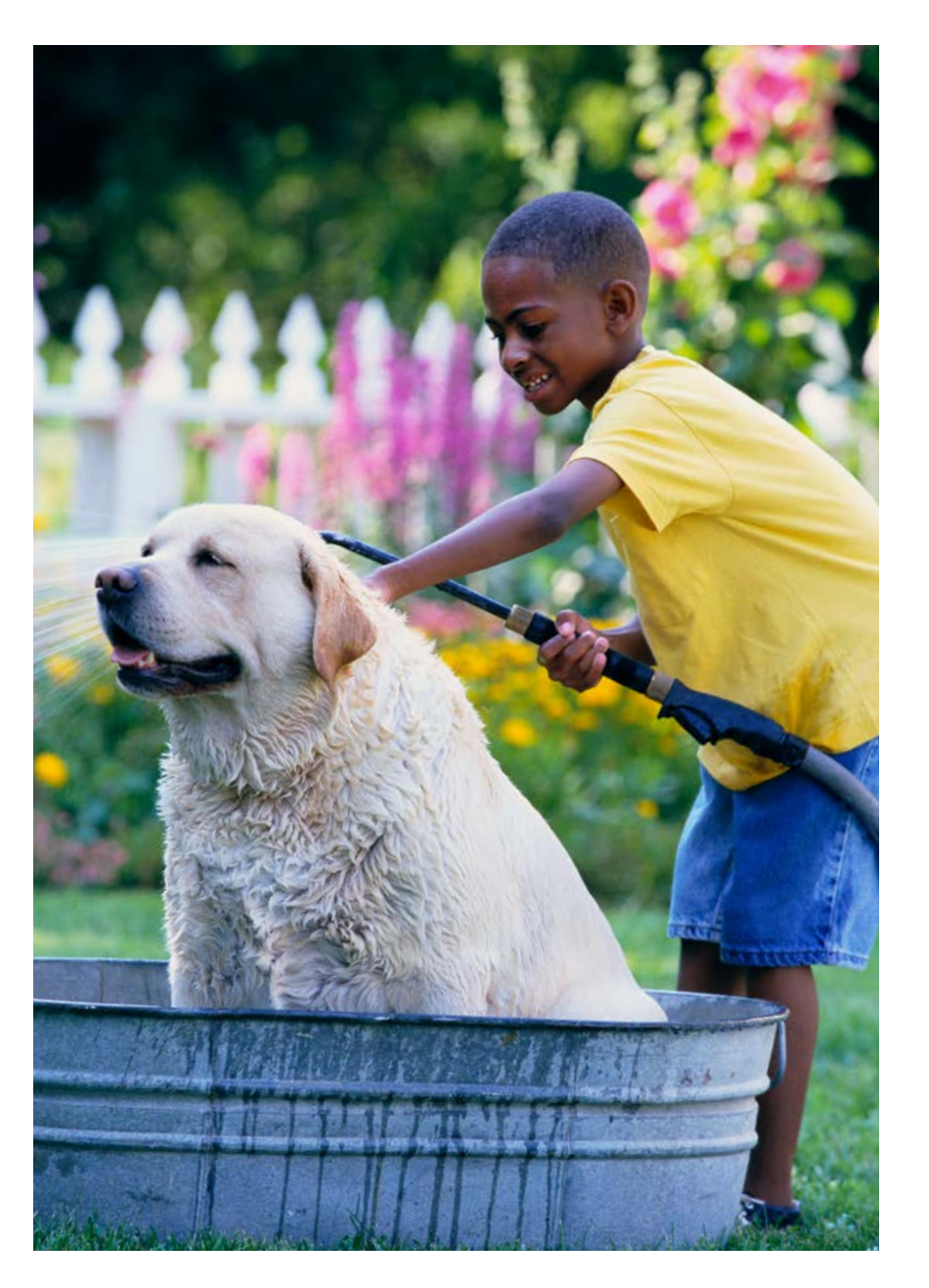
Your dog needs to be brushed and washed.