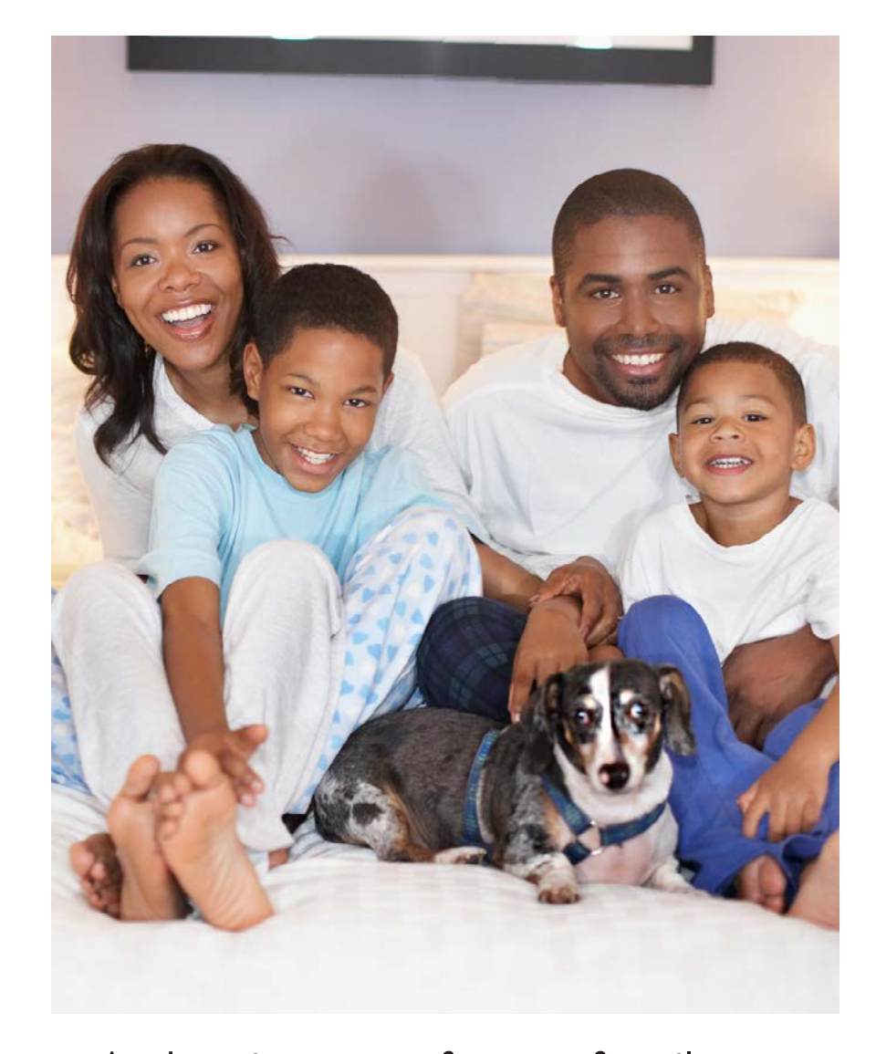
A dog is part of your family. Adding a new dog to your family takes time and special care.