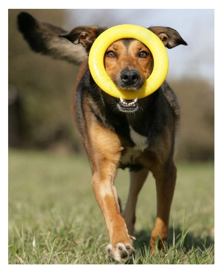
Your family should know all of the things your dog needs. Every dog needs a place to run and play.