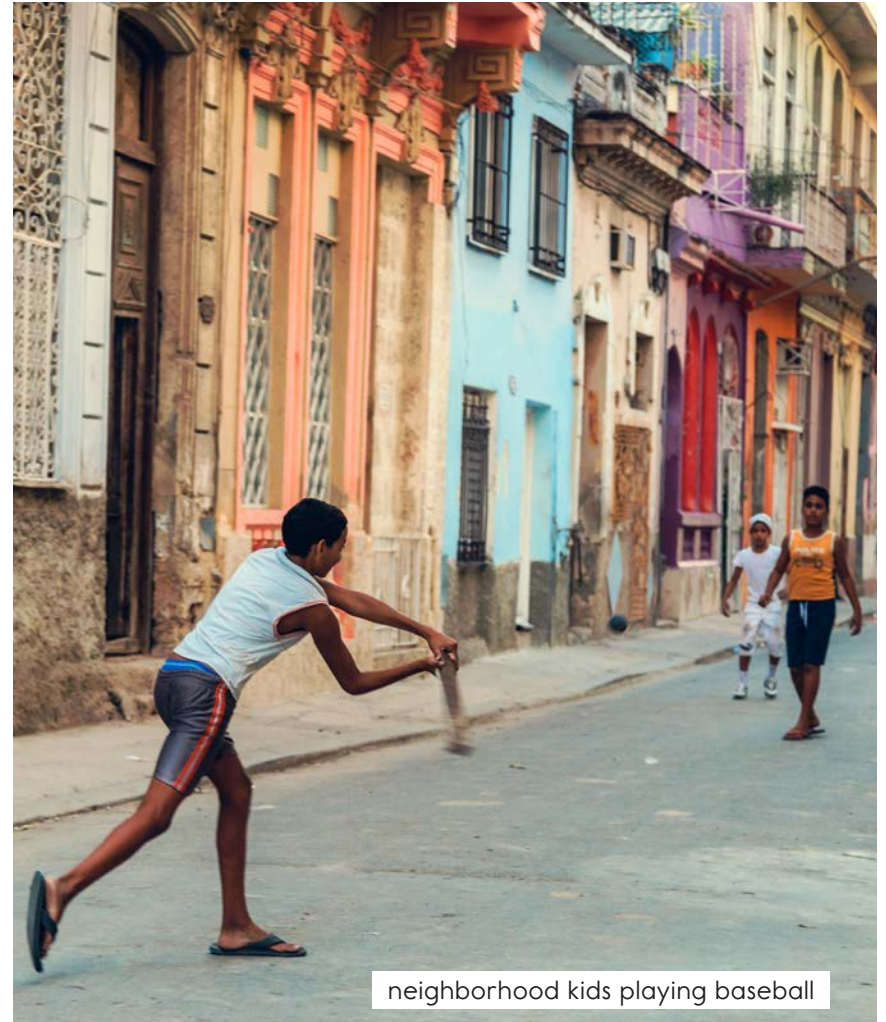
neighborhood kids playing baseball

Some people in communities have things in common. They may share some ideas and experiences .