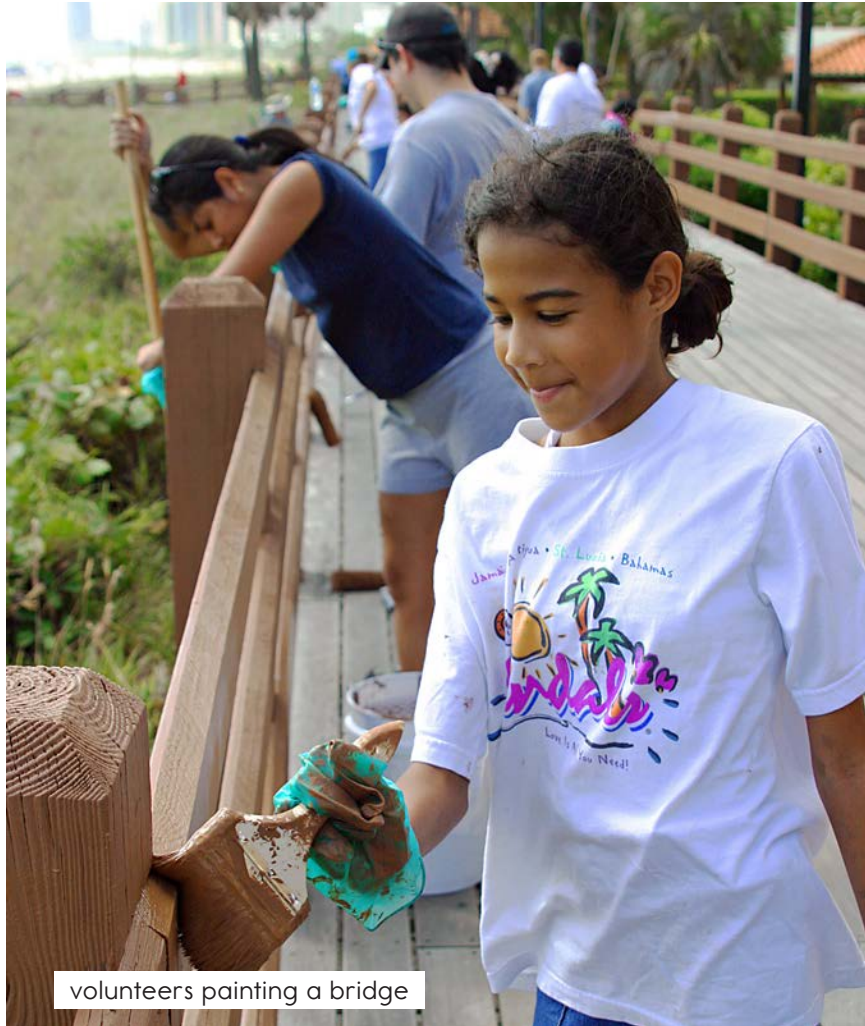
volunteers painting a bridge

Some people in communities work toward the same goals. They may team up to get things done.