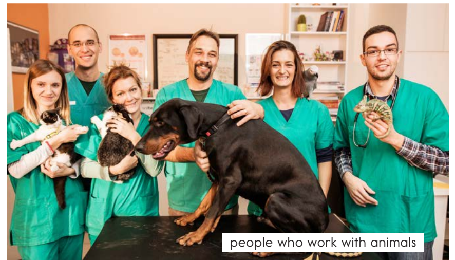
people who work with animals