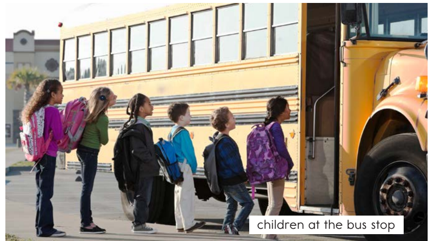
children at the bus stop

Some people in communities live far apart from each other. Other people live closer to each other.