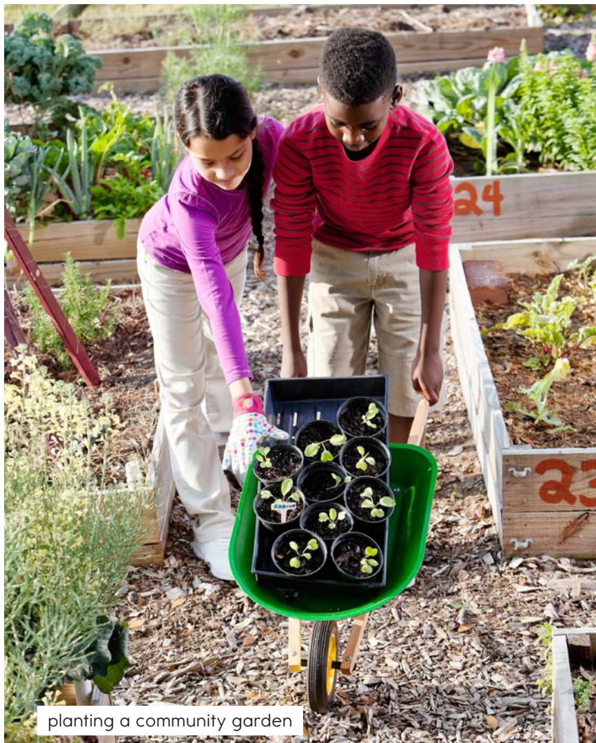
planting a community garden

Some people in communities have things in common. They may share some ideas and experiences .